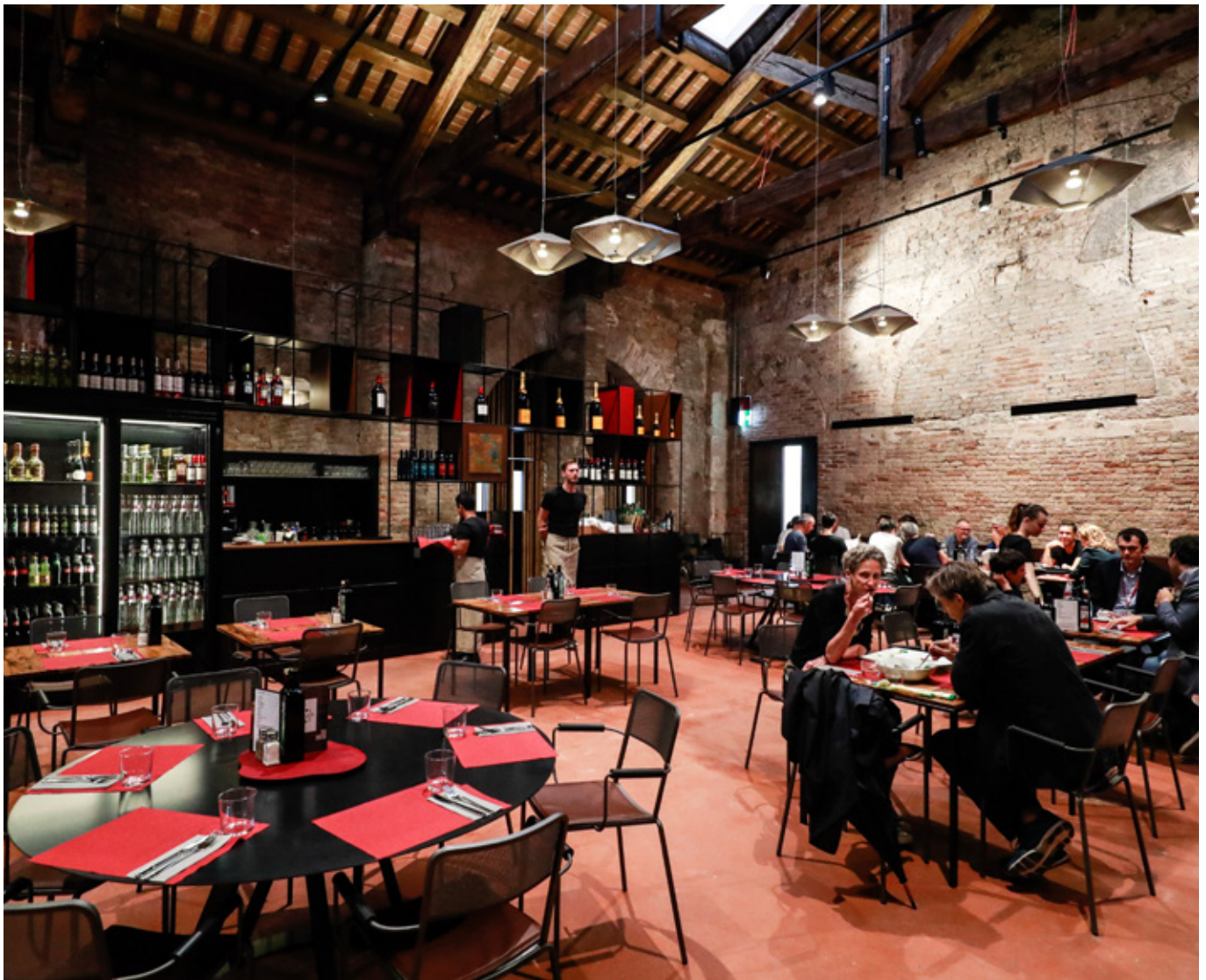
Le Bombarde Restaurant La Biennale di Venezia

You can smell the coffee and the food. You can find other places to eat outside the Corderie and the Artiglierie. You will find little bars where you can drink, eat, rest and look at the view.