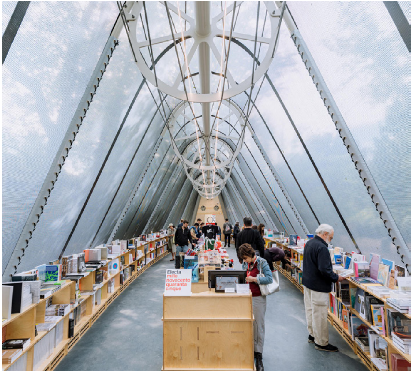
Giardini Bookshop Photo by Luca Chiandoni La Biennale di Venezia

When you finish your visit you can take a look around the Biennale Bookshop.