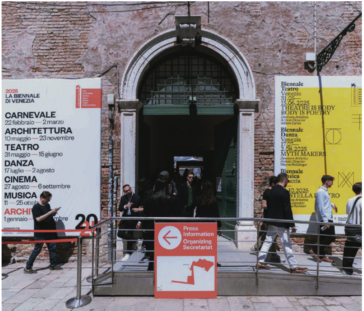
Arsenale entrance Photo by Luca Chiandoni La Biennale di Venezia

The second venue in which the Exhibitions of La Biennale di Venezia take place is the Arsenale.