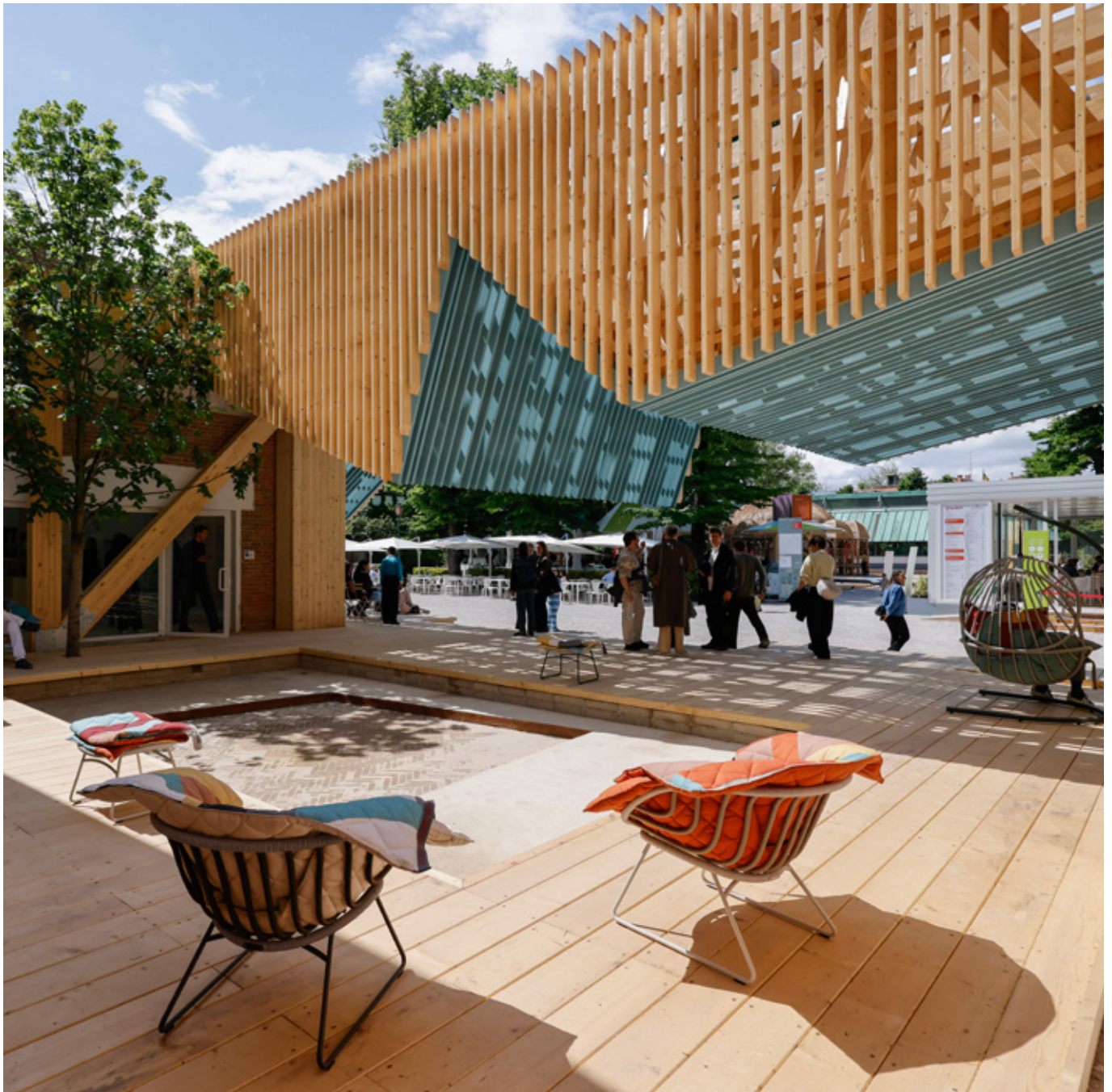
United States Pavilion, Giardini Foto Jacopo Salvi La Biennale di Venezia

Inside each pavilion you can find the projects by the architects, that is what each architect has decided to build.