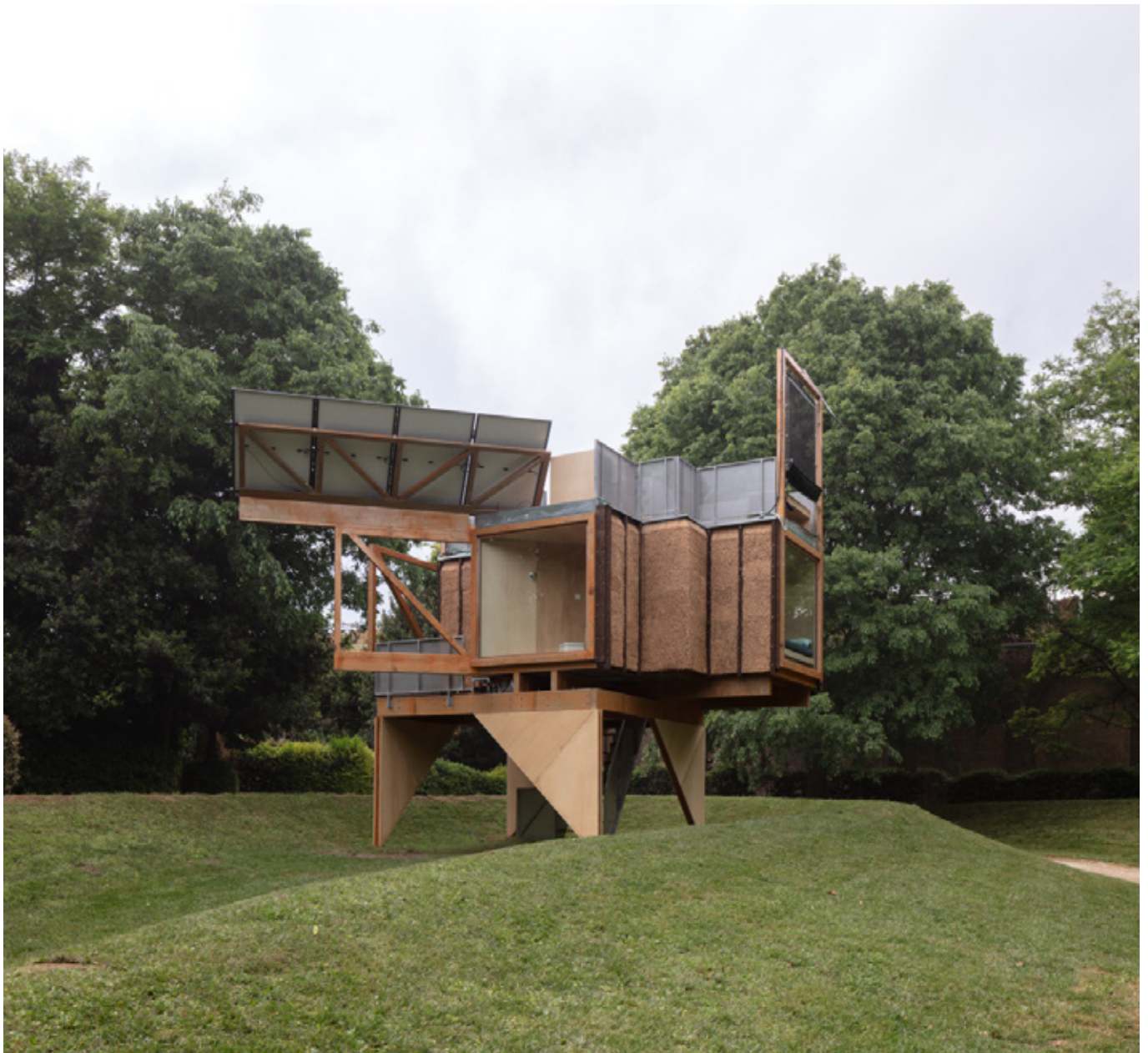
Deserta Ecofolie Giardino delle Vergini

Also in this garden you can encounter the works of the artists of the Exhibition.