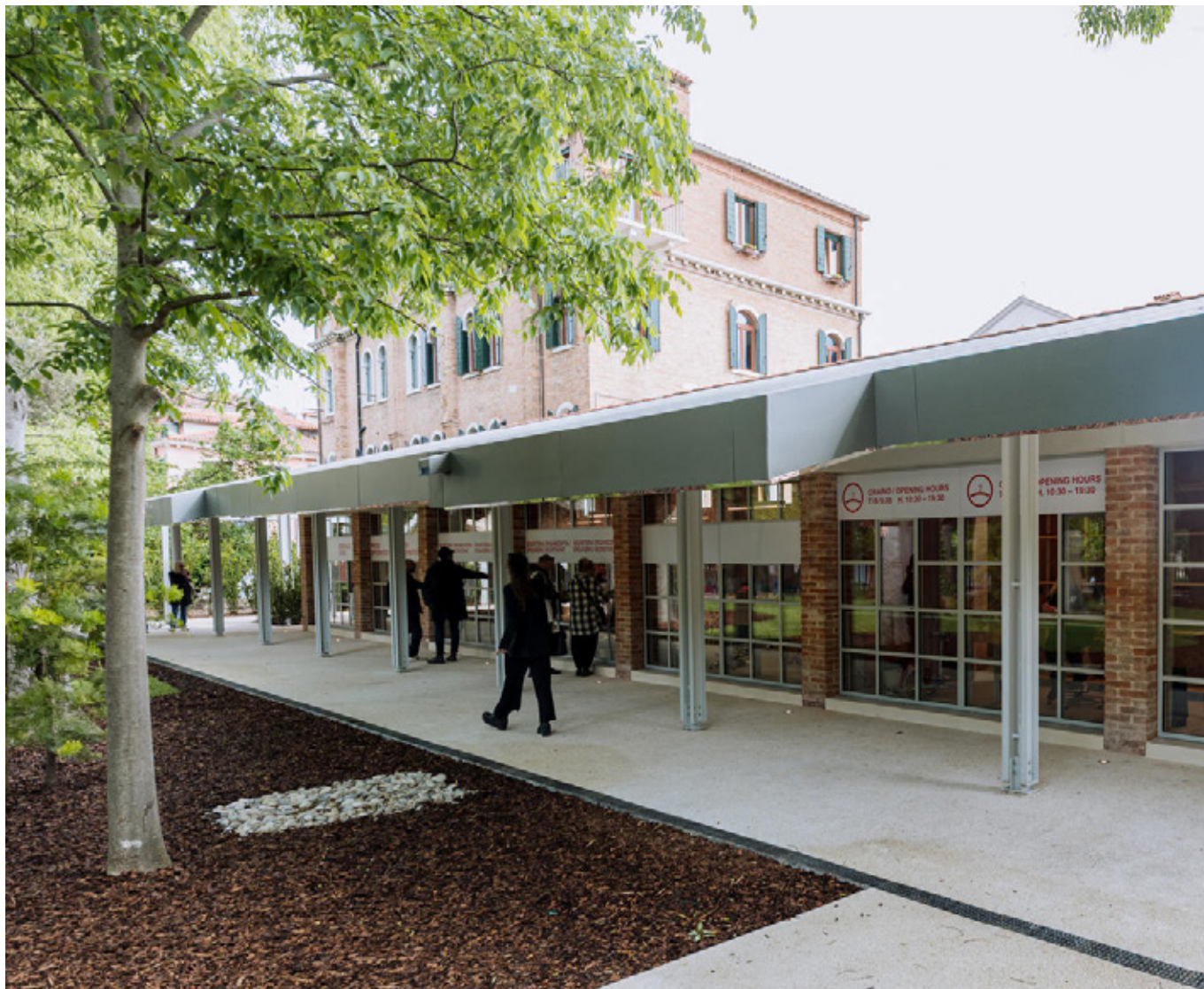
Giardini Infopoint / Ticket Office