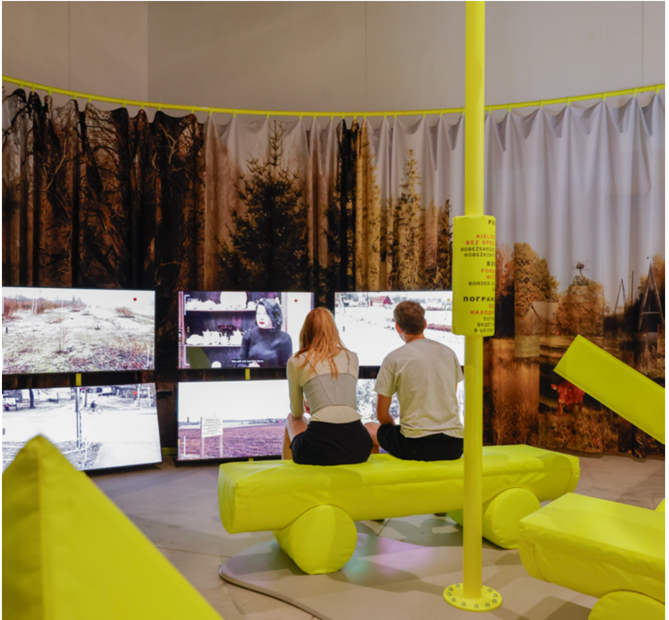
Latvian Pavilion Artiglierie, Arsenale Photo by Luca Chiandoni La Biennale di Venezia

You can also find installations, sculptures, spaces.