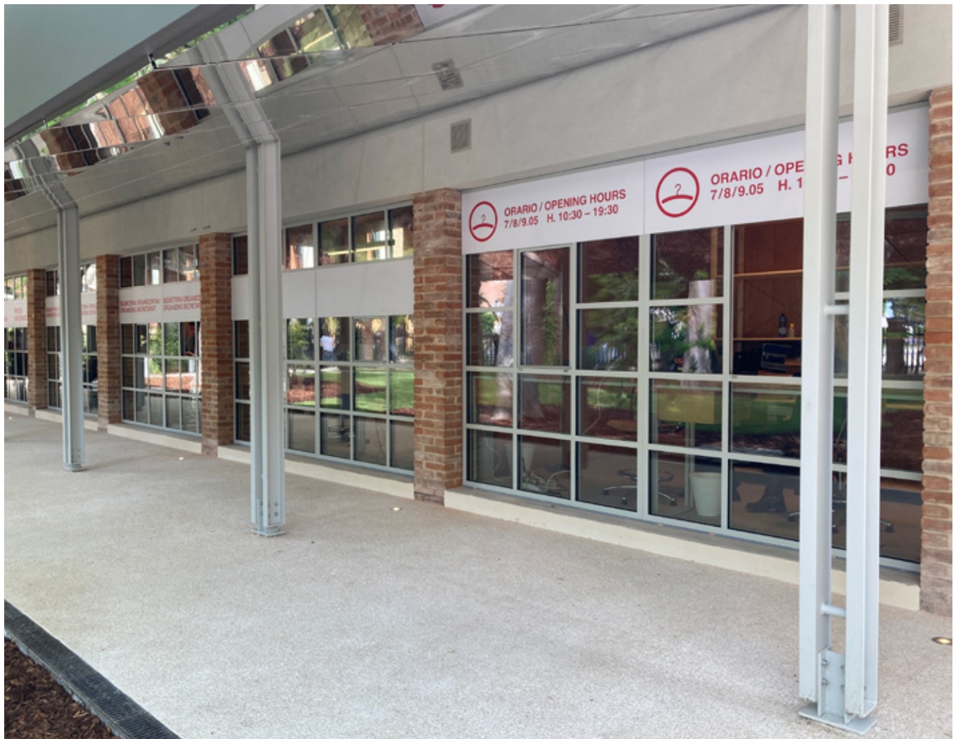
Giardini wardrobe La Biennale di Venezia

At the Giardini, there is a place where you can store small objects (like small bags or jackets).