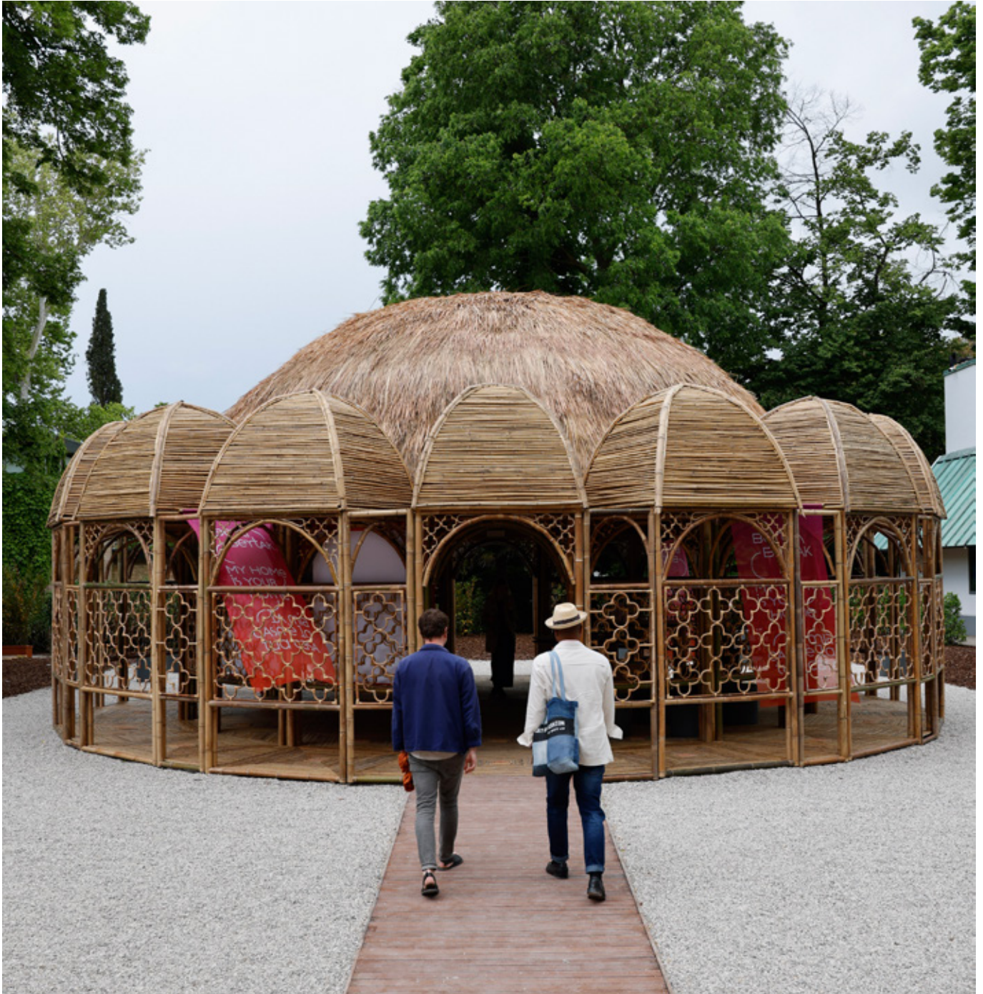
Qatar Pavilion, Giardini

A space can be a room for example, such as a bedroom, or even a bathroom. A space can also be a cabin.