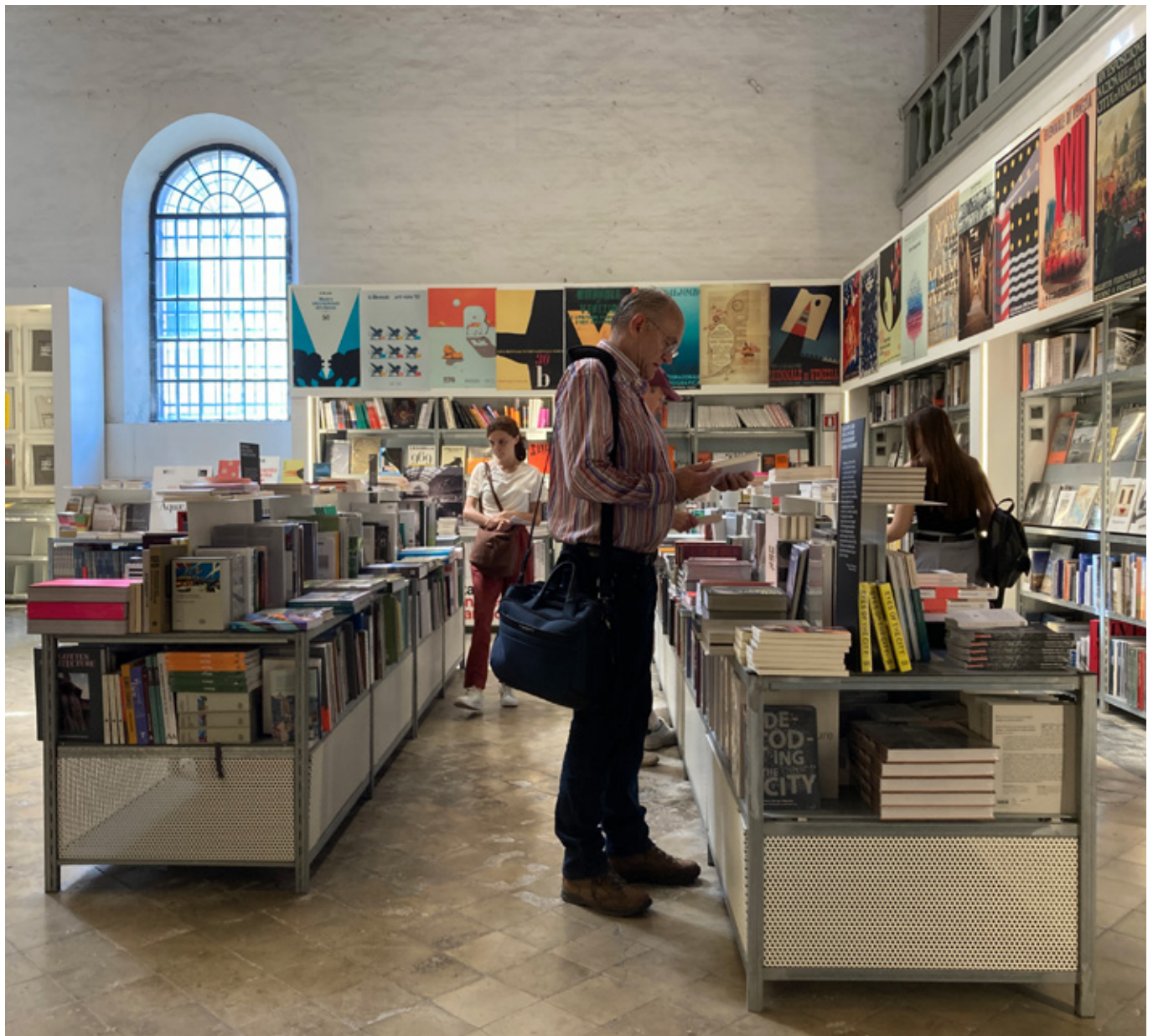
Arsenale Bookshop La Biennale di Venezia

When you finish your visit you can take a look around the Biennale Bookshop .