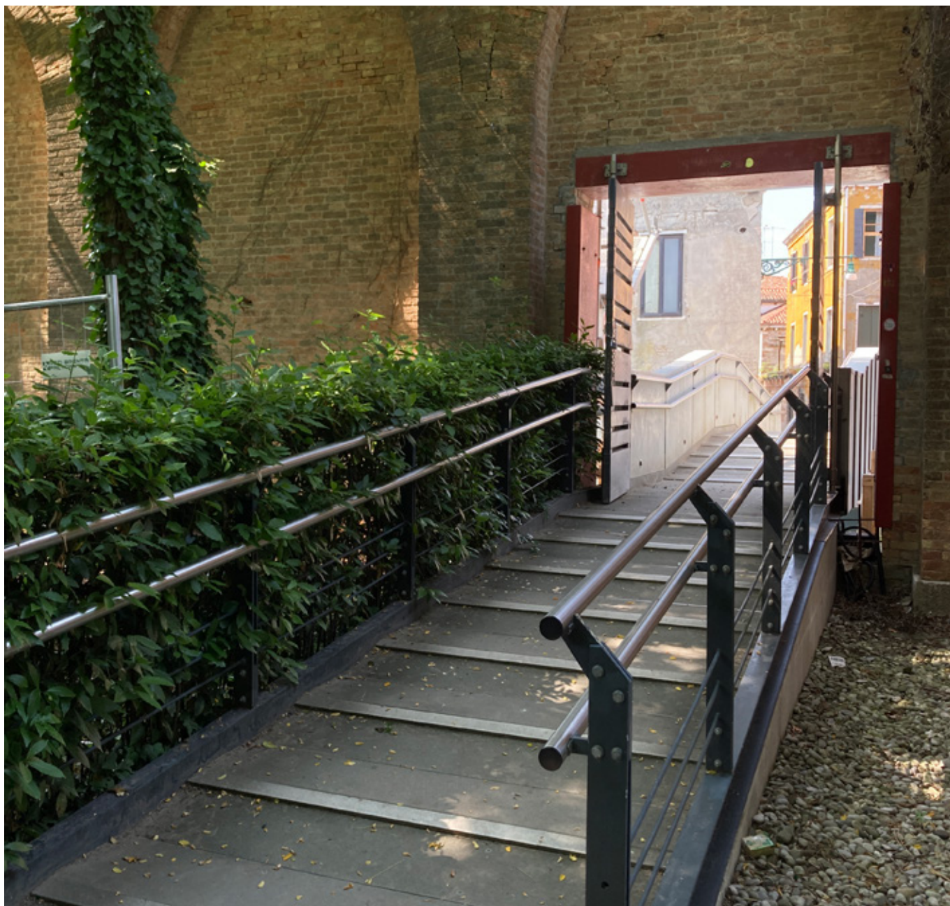
Ponte dei Pensieri La Biennale di Venezia

Throught this bridge it is possible to enter and exit this location.