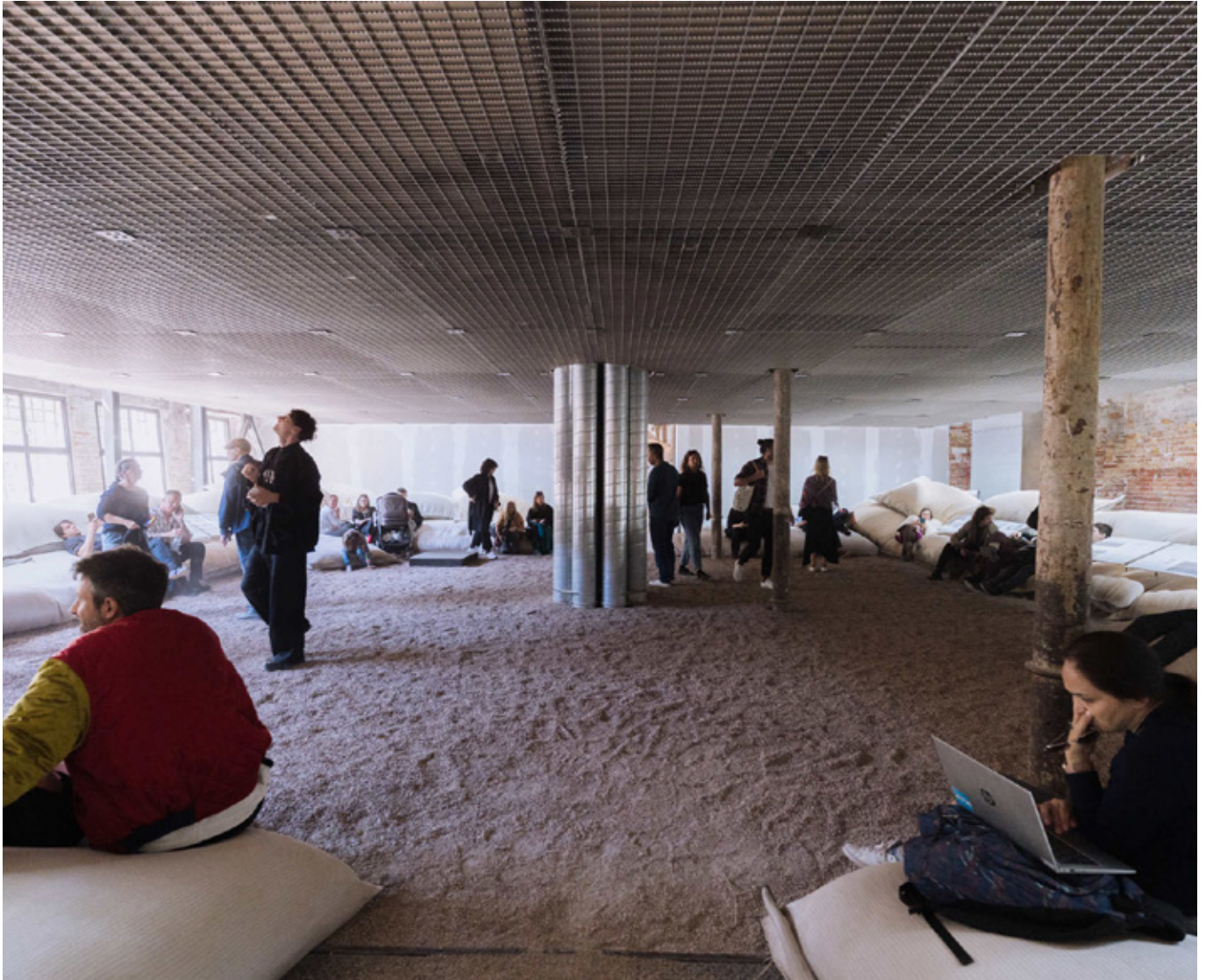
Kingdom of Bahrain Pavilion Artiglierie, Arsenale