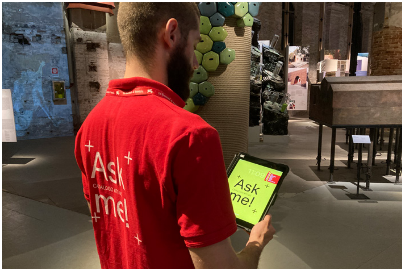
Catalogo attivo La Biennale di Venezia