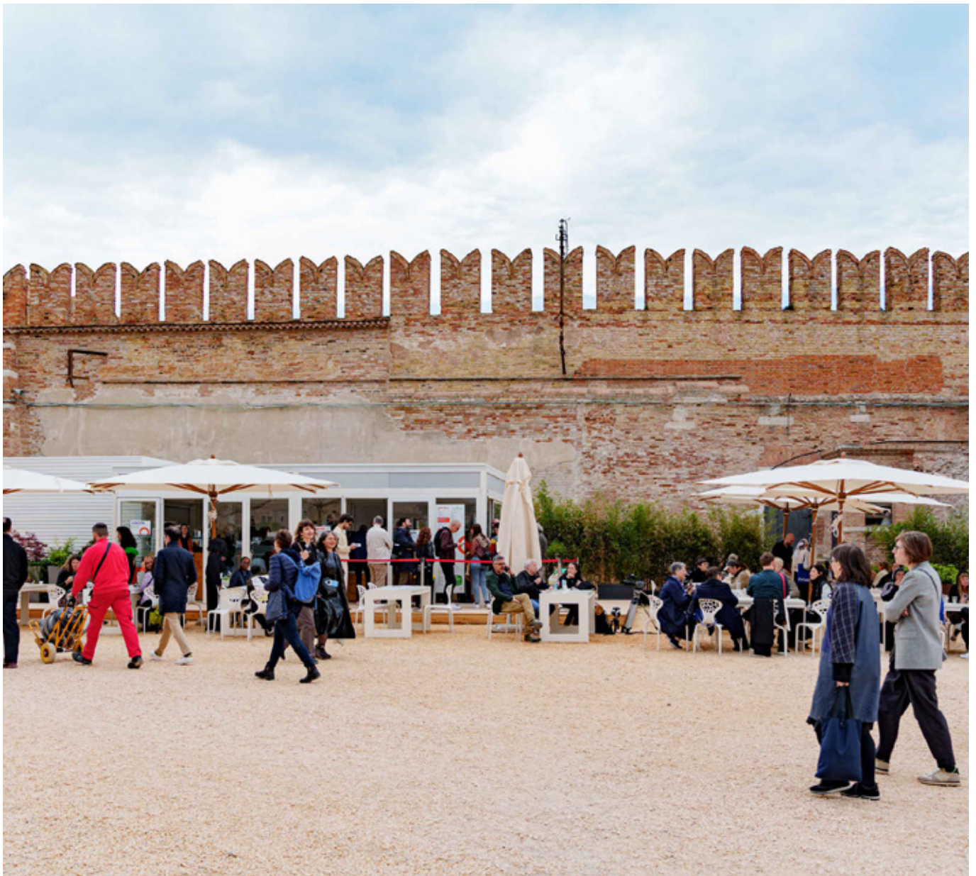
Alla Gru Cafe, Arsenale Photo by Luca Chiandoni La Biennale di Venezia