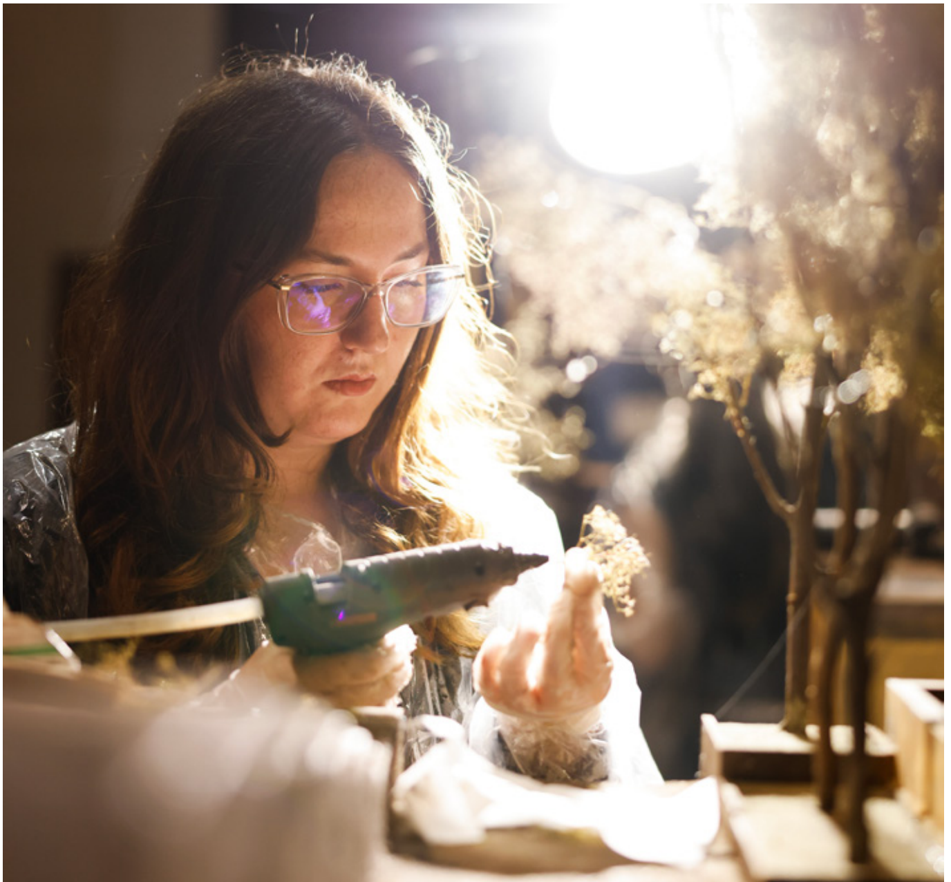
Revival of Ordinary Trees, Corderie, Arsenale