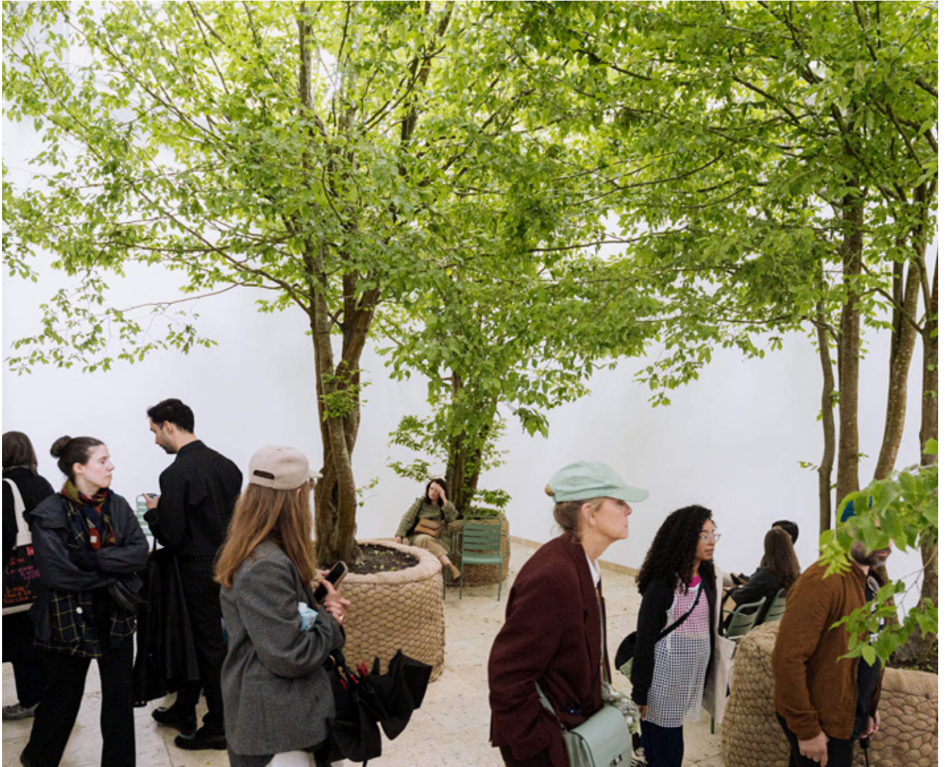
German Pavilion, Giardini

Instead of just reducing damage, we need to build strong and stable houses and buildings. We must build homes that can protect us from intense heat from drought from heavy rains from hail.