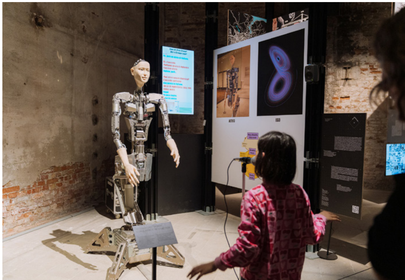
Am I a Strange Loop? (robot), Corderie, Arsenale

The title of this year exhibition is “ Intelligens . Natural. Artificial. Collective.”