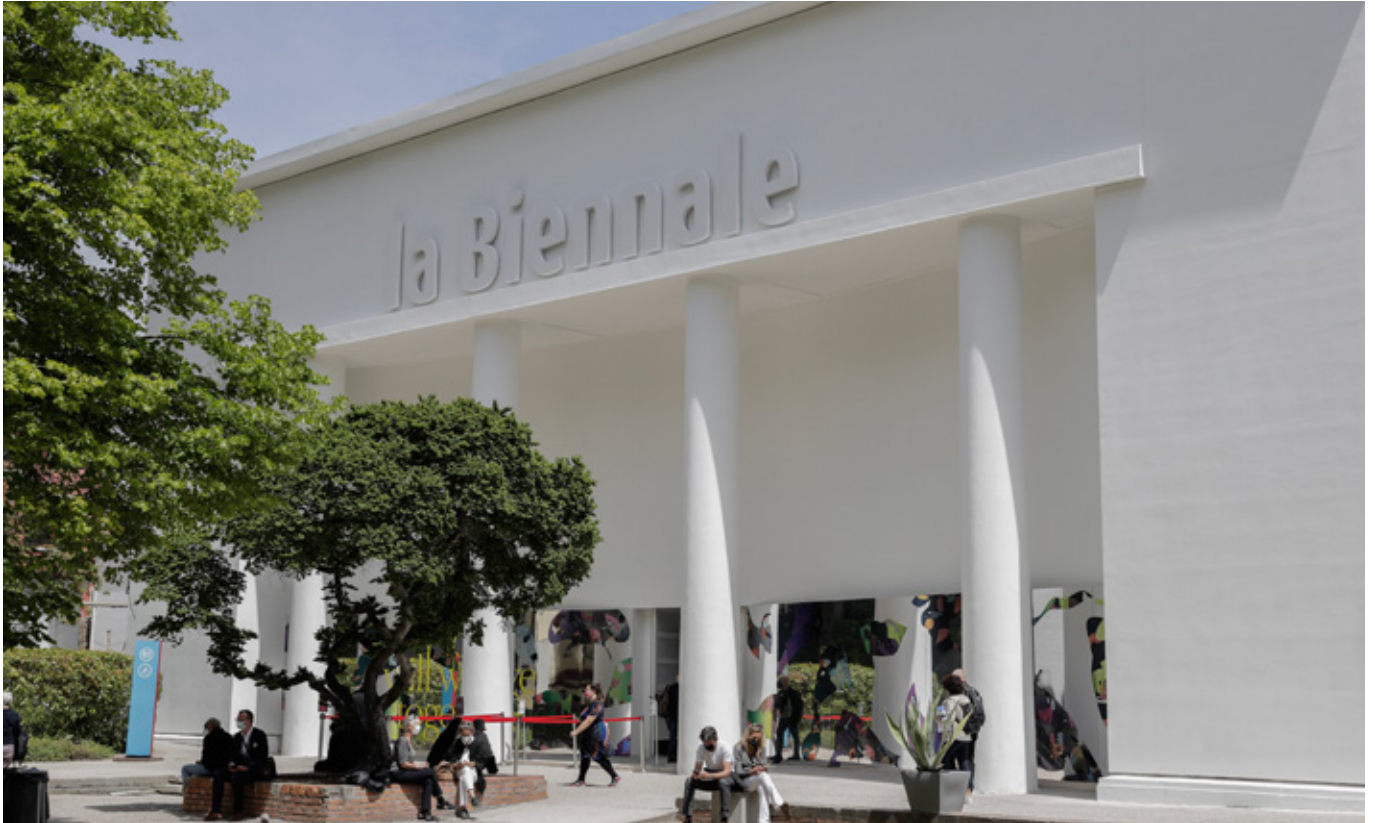
Central Pavilion, Giardini

The Central Pavilion is a big white pavilion, it is the biggest pavilion of all.