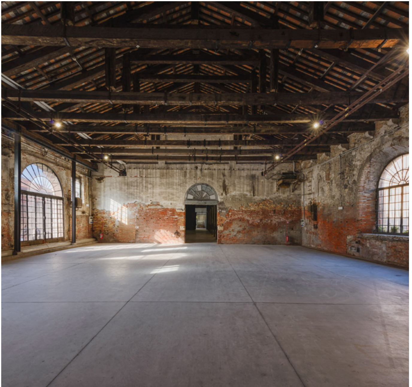
Artiglierie, Arsenale

Most of these buildings were built in the sixteenth century.