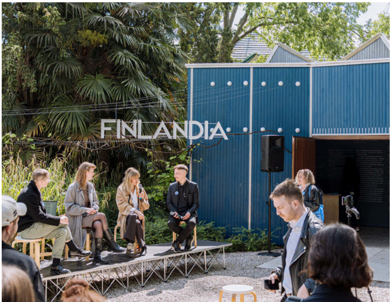
Finland Pavilion, Giardini Photo by Luca Chiandoni La Biennale di Venezia

Inside each pavilion there is a small exhibition with projects and artworks that come from the Country named on the front of the building.