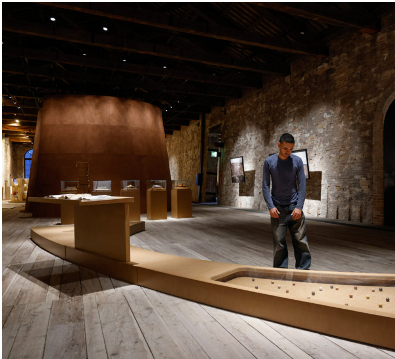
Turkish Pavilion Sale d'Armi, Arsenale

In front of the Artiglierie you will find the Sale d'Armi , which were used as a place to display weapons. This happened during the times of the Serenissima (as Venice once was called).