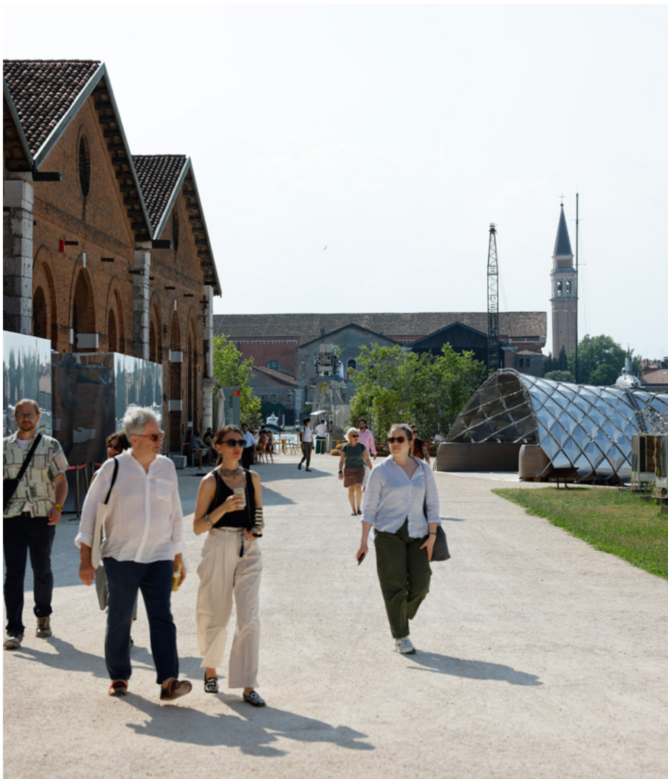
Arsenale outdoors Photo by Jacopo Salvi La Biennale di Venezia

If you want you can take a walk outside the buildings.