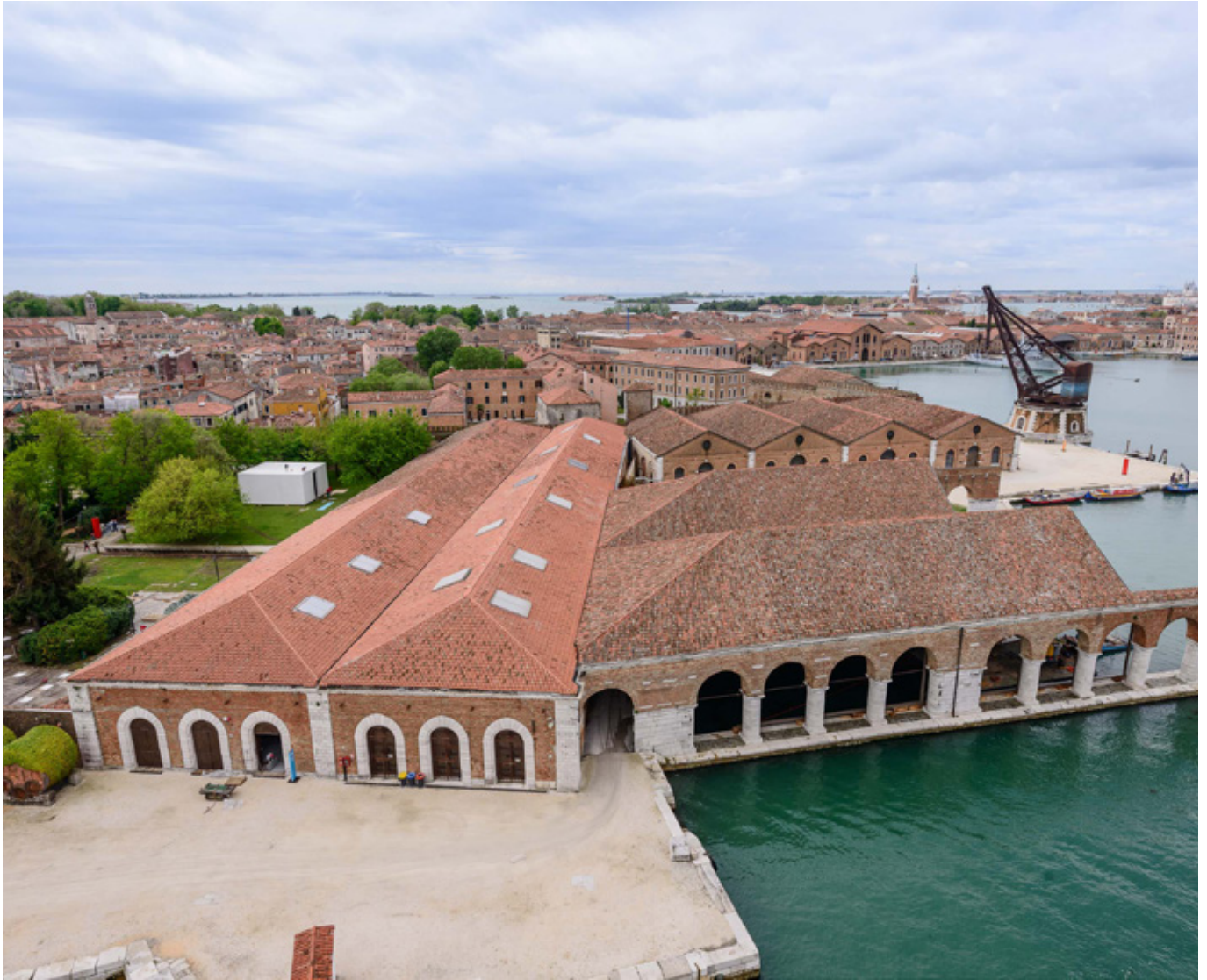
Bird's-eye view of the Arsenale

The Arsenale di Venezia is a very old place.