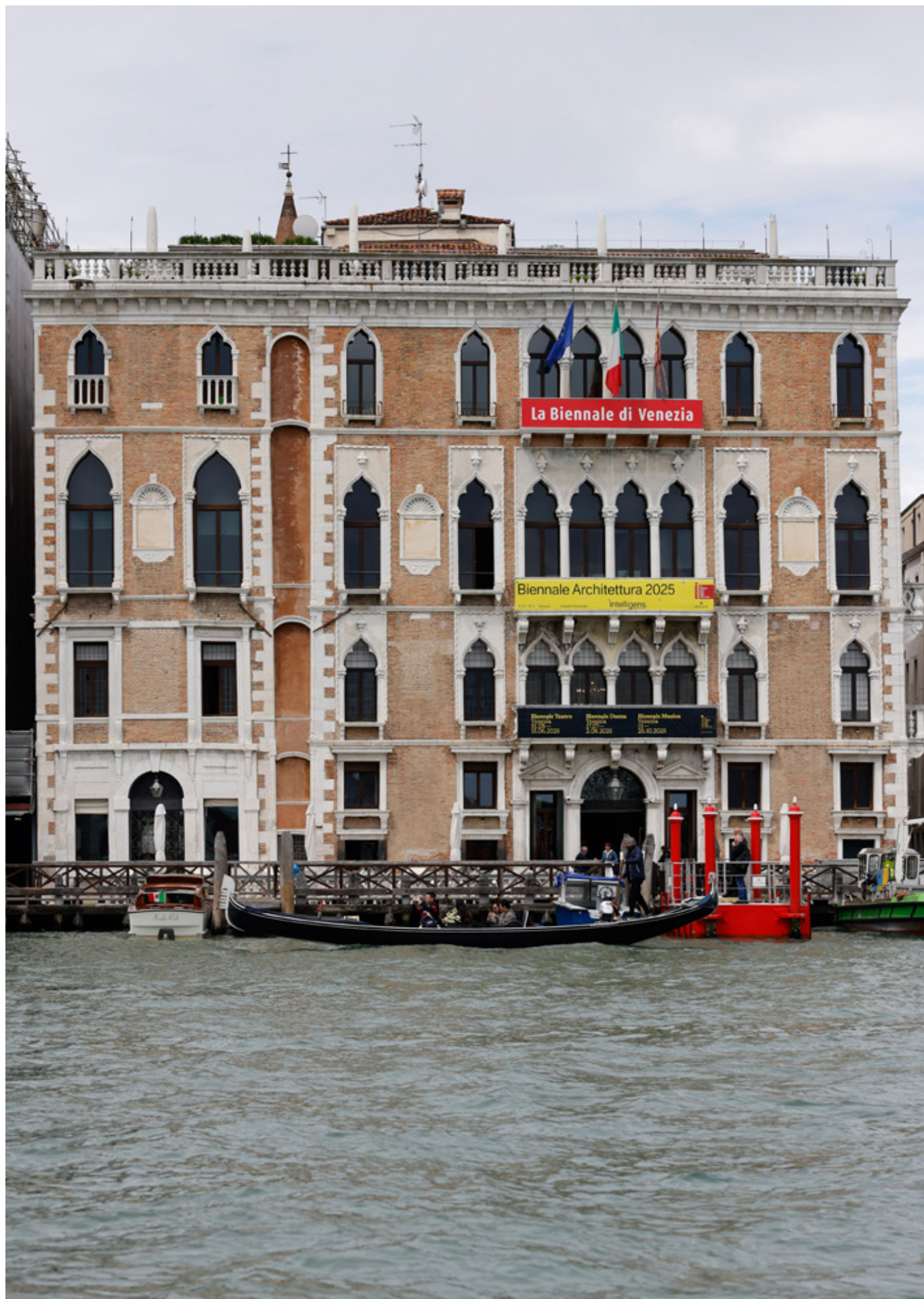
Ca' Giustinian, headquarters of La Biennale di Venezia