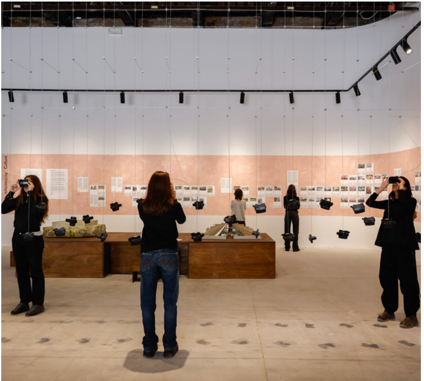
Albania Pavilion Artiglierie, Arsenale Photo by Jacopo Salvi La Biennale di Venezia