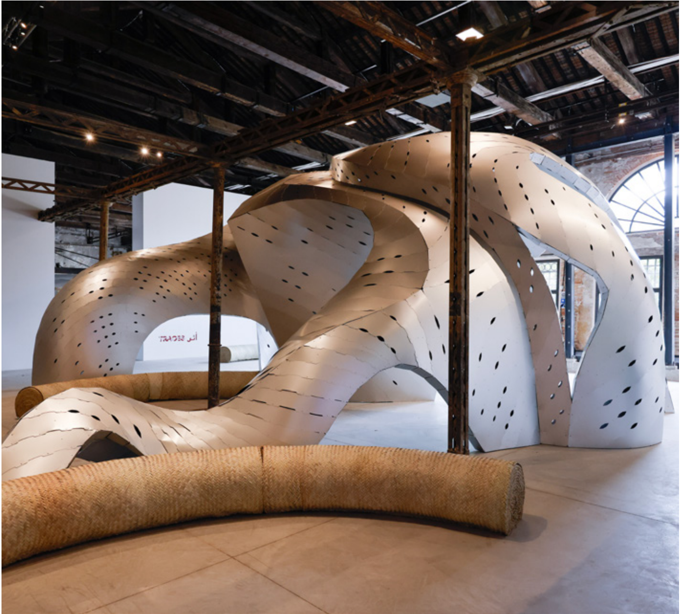
Sultanate of Oman Pavilion Artiglierie, Arsenale Photo by Jacopo Salvi La Biennale di Venezia

The Artiglierie building is divided into different spaces, where you can find the projects by architects from different nations.