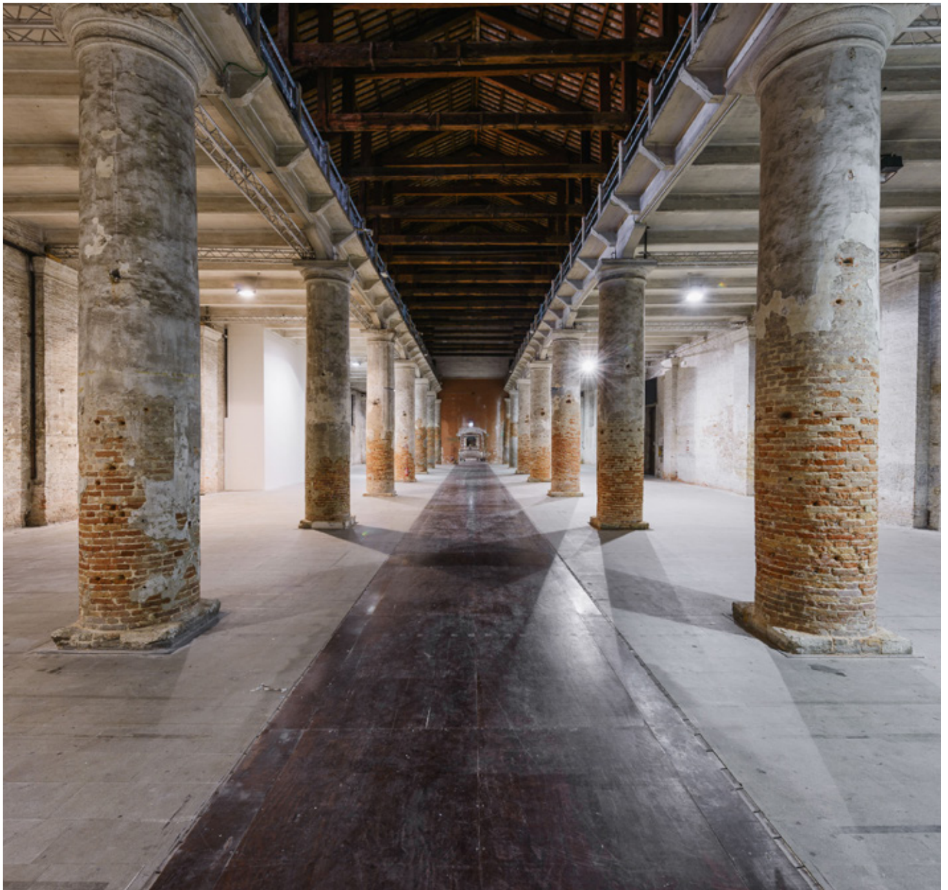
Corderie, Arsenale

In this big building divided by columns, they made ropes for the ships. The Italian word for ropes is ‘corde’. That is why this building is called Corderie.