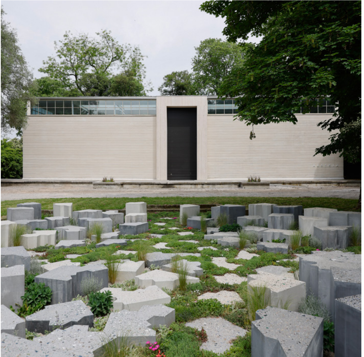
Austrian Pavilion, Giardini

Inside the Austrian Pavilion you can find drawings and projects that come from Austria.