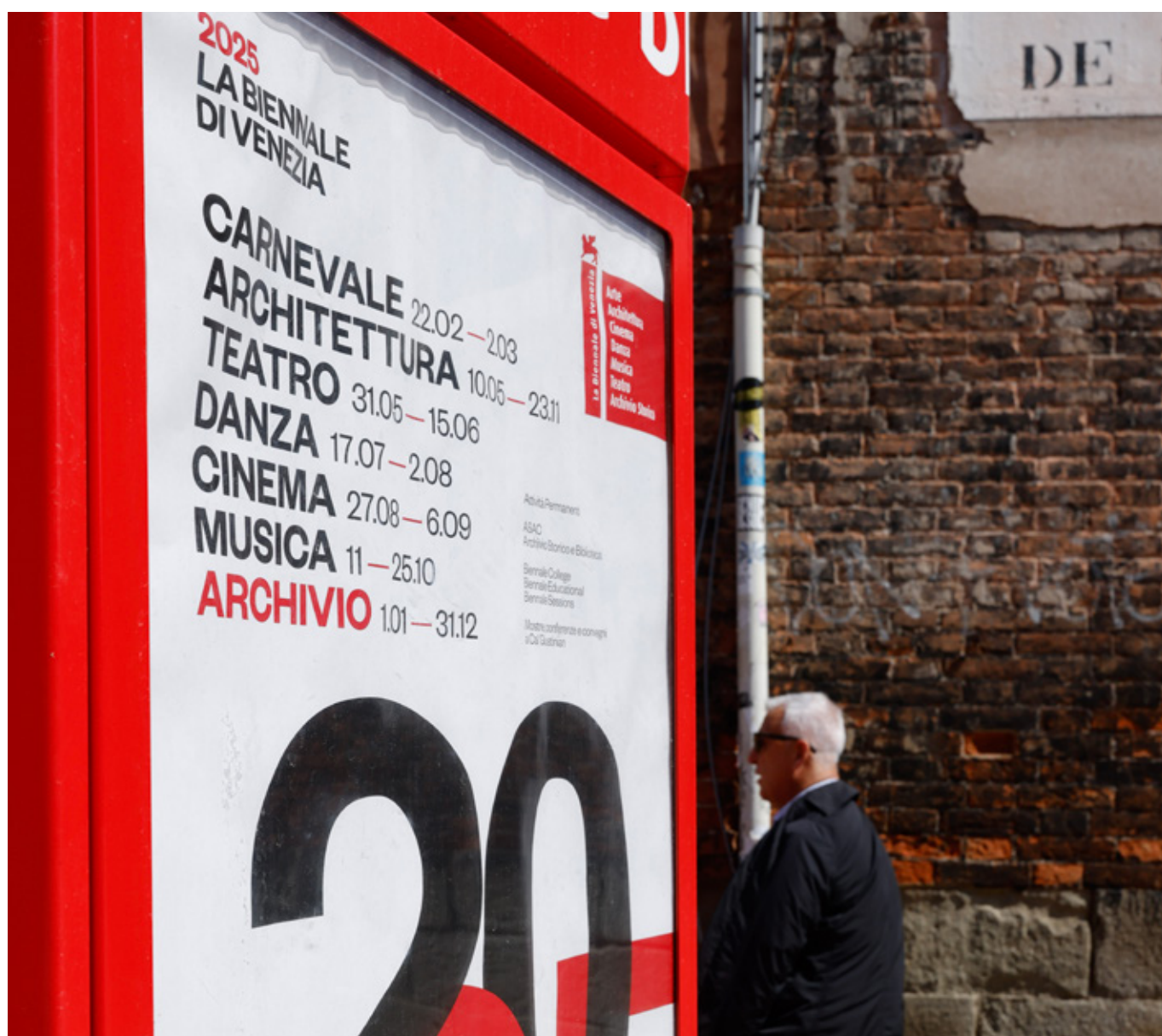
La Biennale di Venezia

La Biennale di Venezia organizes exhibitions that last a few months. This is why every year you can see different artworks or projects.