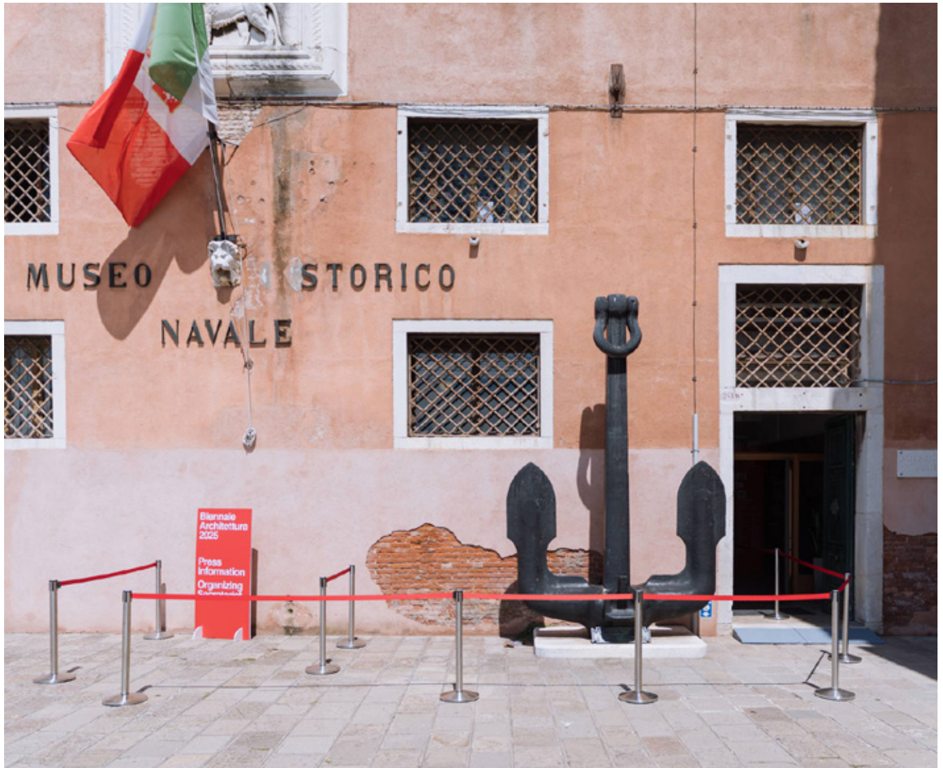
Arsenale Infopoint / Ticket Office