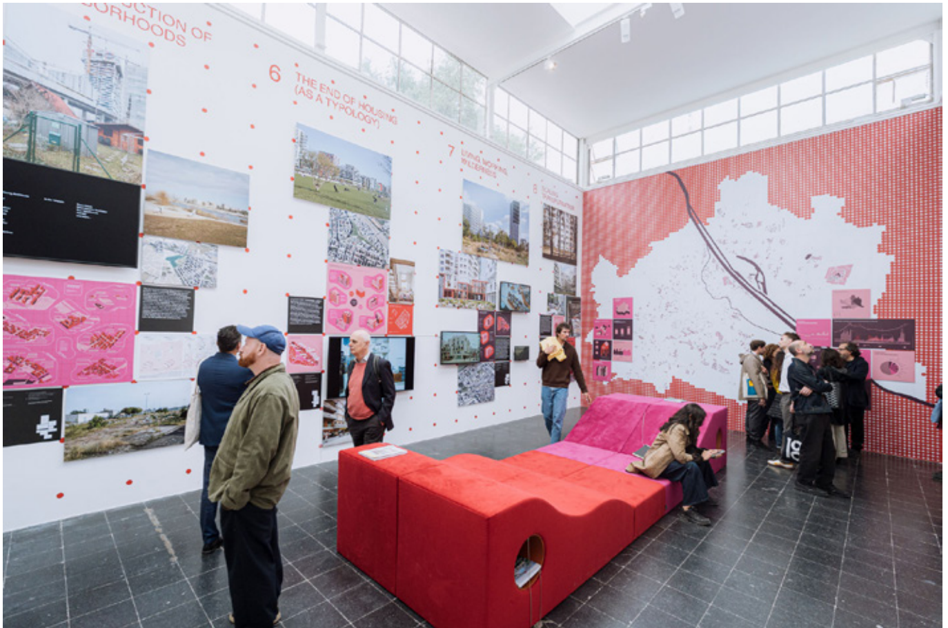
Austrian Pavilion, Giardini

At the Architecture Exhibition you will find projects designed by architects.