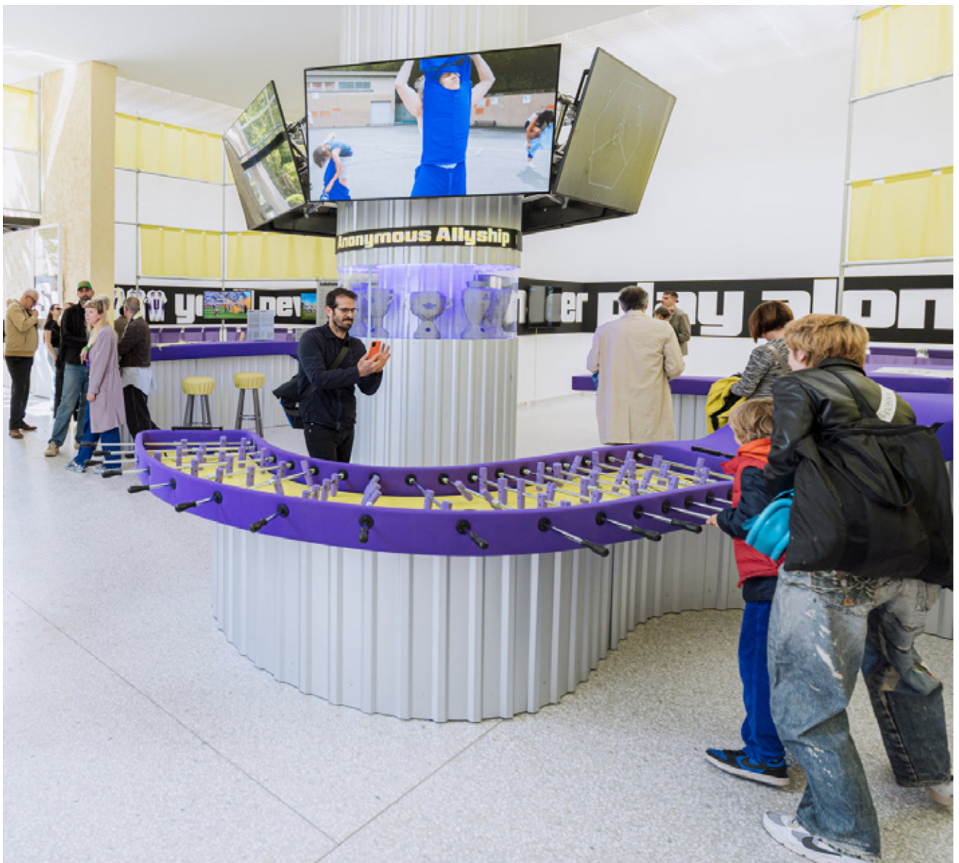
The Netherlands Pavilion, Giardini